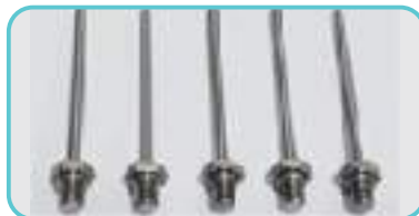
Unopened Capsule Ejection Pin