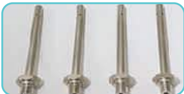
Bush Cleaning Pin