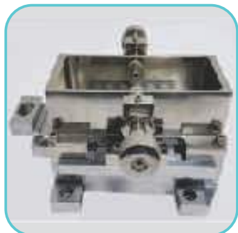
Pellet Dosing Chamber