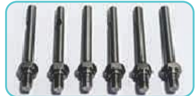
Capsule Closing Pin