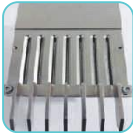
Magazine with vertical finger