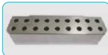
Body Segment for PF 150 / 150T