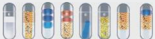
Powders / Pellets / Tablets / Combination Filling

These machines are provided with productivity enhancing features, which can be handled by a single operator.