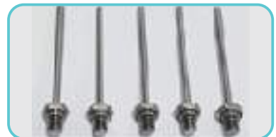
Capsule Ejection Pin