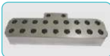
Cap Segment for PF 150 / 150T