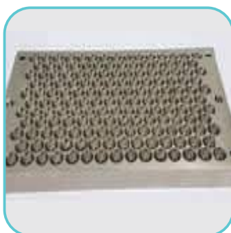
Sorting Plate - SE 100